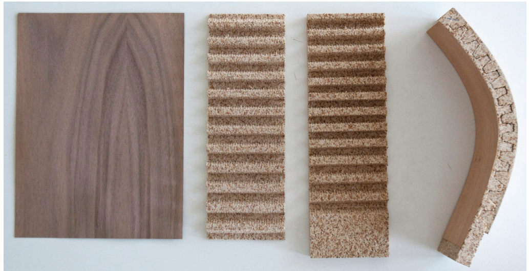
Figure 2 'Recoflex' is a composite of wood, cork, and latex particles. It is quite elastic, but becomes very stiff as soon as layers of veneer are glued to the tops. ETH RAPLAB, Zürich, July 2010

The elasticity of the wood-cork-latex core is clearly noticeable for the daybed's user and contributes to the object's comfort. It is a surprising effect, as the veneer tops do not hint to this behaviour.