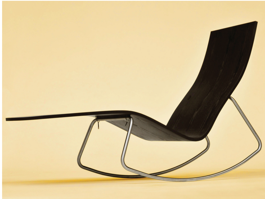
Figure 3 The 'ZipLiege' is made of an 18mm Recoflex core covered with ash veneers. The shape is derived from body dimensions. It was 5-axis sawn at Schreinerei Schnidrig in Visp and vacuum-glued at BFH-AHB in Biel. Designers' Saturday 2010, Langenthal, November 2010

The foam cutter is able to cut any ruled surface. Consequently, we experimented extensively with edge fillets and advanced interlocking systems. The hot wire is especially interesting for twisted geometries, where teeth flanks are not planar and therefore cannot be sawn (Figure 4). To make the XPS panels resistant to tension, we used once more wood veneer as top layers on both faces.