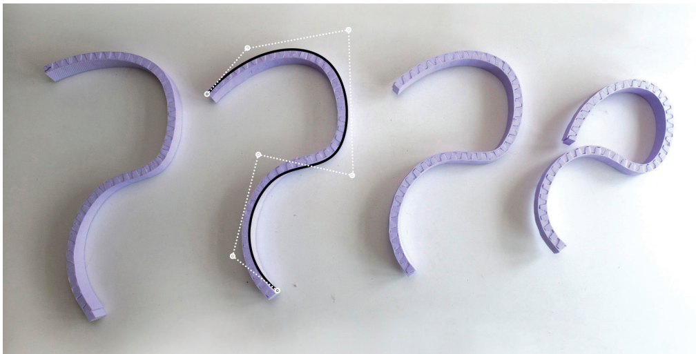
Figure 5 Four XPS samples with an increasing 'resilience factor' that exaggerates the curvature in the unrolled surfaces. The black curve displayed on top of the second sample is the original master curve. ETH RAPLAB, Zürich, August 2010

Having started from an abstract geometric model, we learned first to take the fabrication constraints